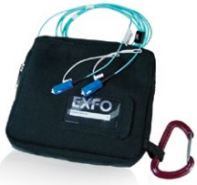
EF launch fiber (SPSB-EF-C30)

Whether for expanding enterprise-class businesses or large-volume data centers, new high-speed data networks built with multimode fibers are running under tighter tolerances than ever before. In the event of failure, intelligent and accurate test tools are needed to quickly find and fix the fault.